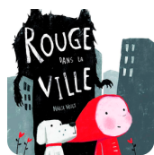
Red in the City