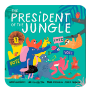
The President of the Jungle