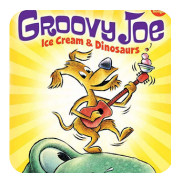
Groovy Joe and the Dinosaurs